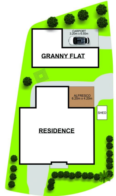
Site Plan Not On Scale